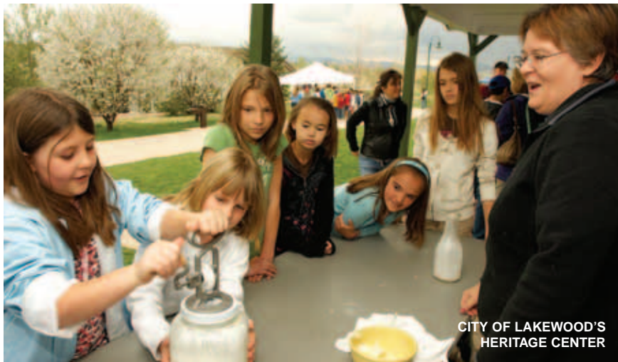
CITY OF LAKEWOOD'S HERITAGE CENTER