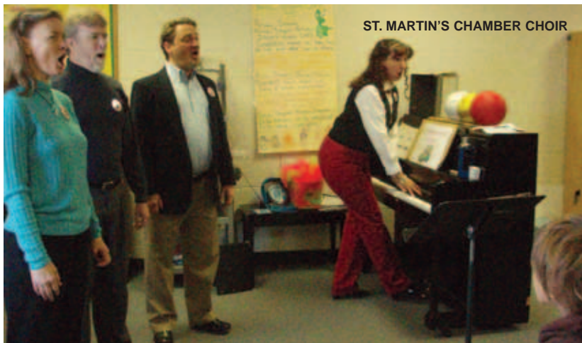
ST. MARTIN'S CHAMBER CHOIR