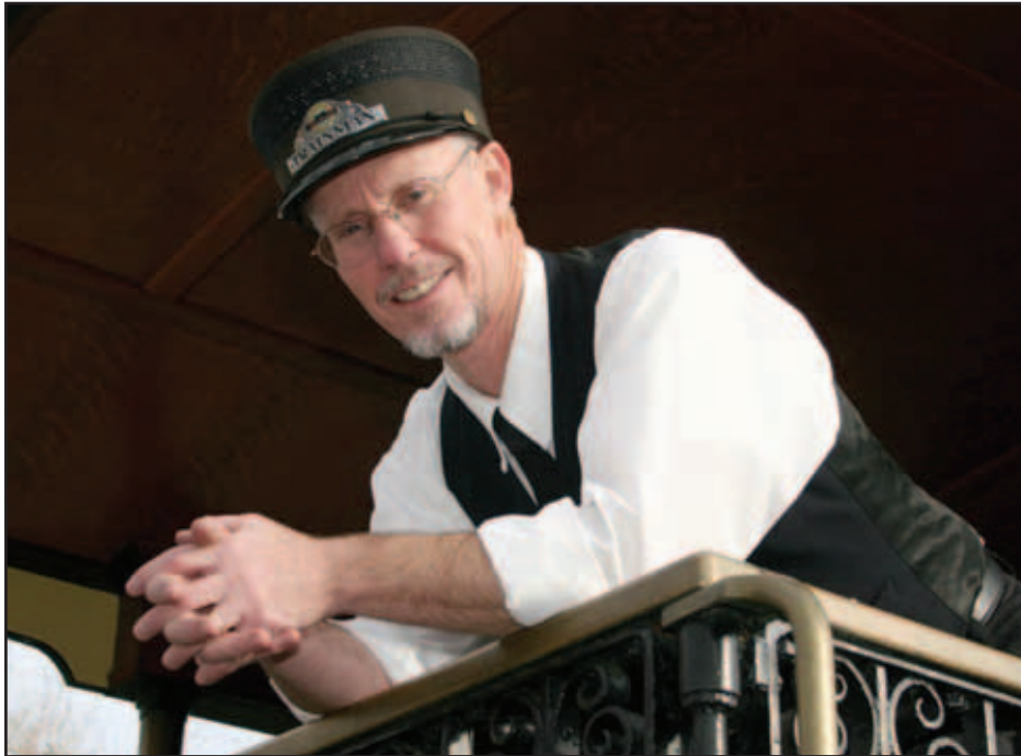
COLORADO RAILROAD MUSEUM