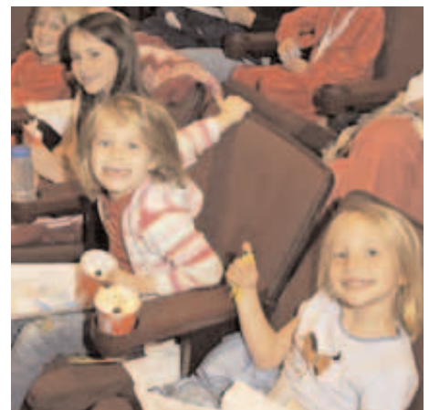
DENVER FILM SOCIETY