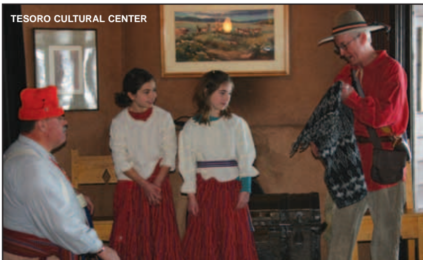
TESORO CULTURAL CENTER