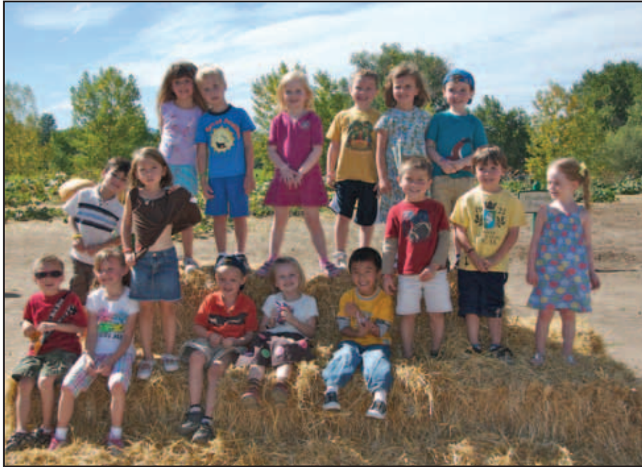
THE HUDSON GARDENS AND EVENT CENTER