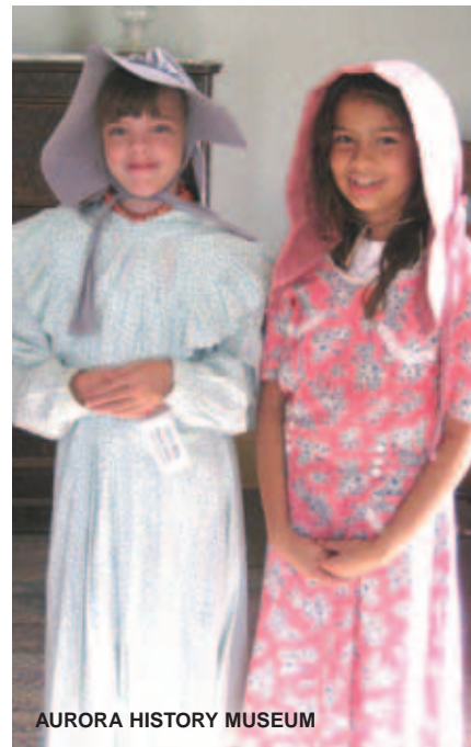
AURORA HISTORY MUSEUM