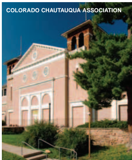
COLORADO CHAUTAUQUA ASSOCIATION