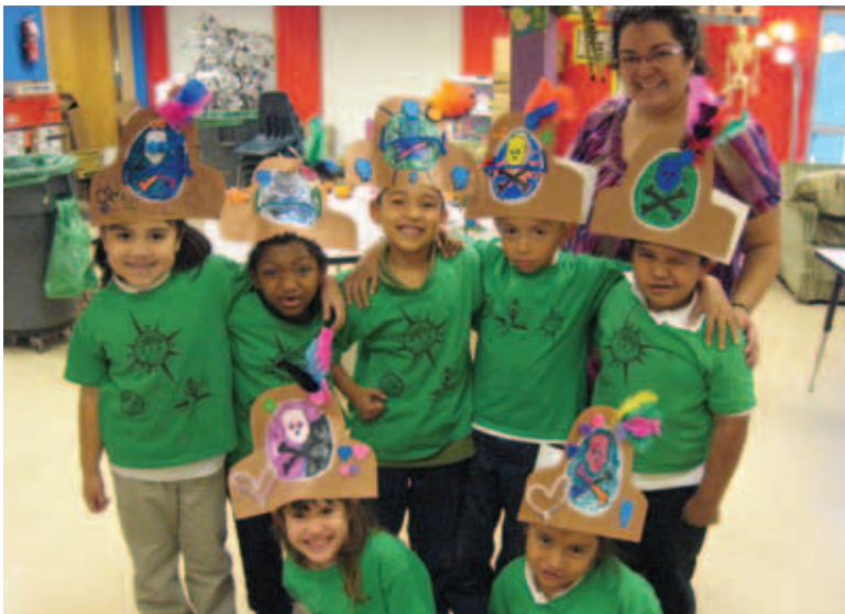
CITY OF AURORA FOX ARTS CENTER