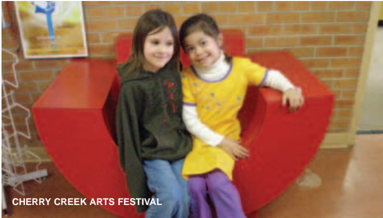
CHERRY CREEK ARTS FESTIVAL