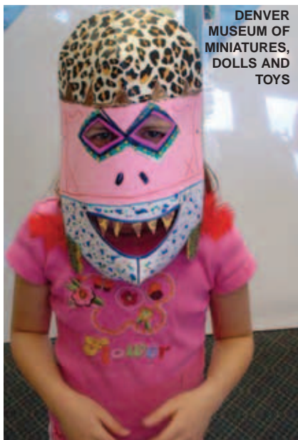
DENVER MUSEUM OF MINIATURES, DOLLS AND TOYS