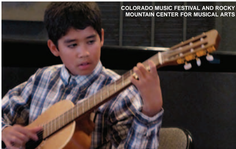
COLORADO MUSIC FESTIVAL AND ROCKY MOUNTAIN CENTER FOR MUSICAL ARTS