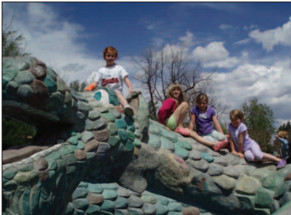
ARVADA CENTER FOR THE ARTS AND HUMANITIES