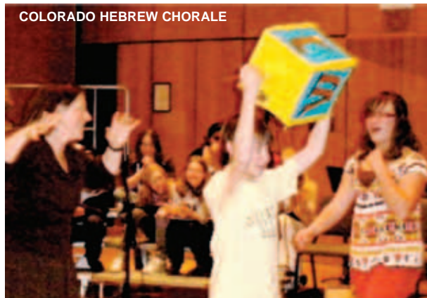
COLORADO HEBREW CHORALE