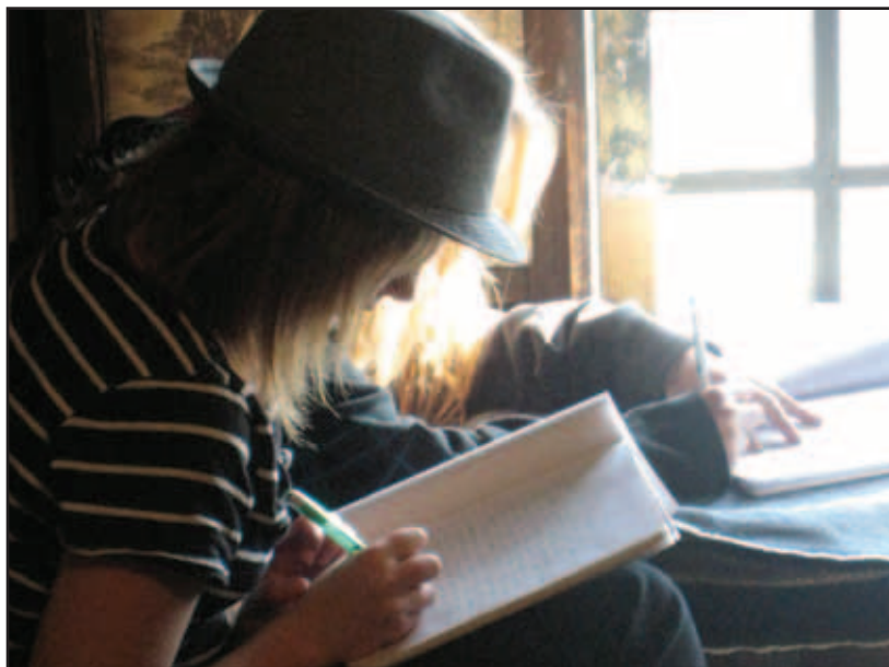
LIGHTHOUSE WRITERS WORKSHOP