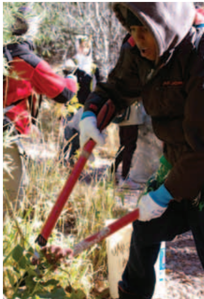
COLORADO MOUNTAIN CLUB (STEWARDSHIP)

www.mychildsmuseum.org 303-561-0113 studentvisits@cmdenver.org