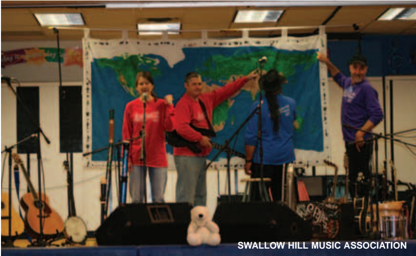
SWALLOW HILL MUSIC ASSOCIATION