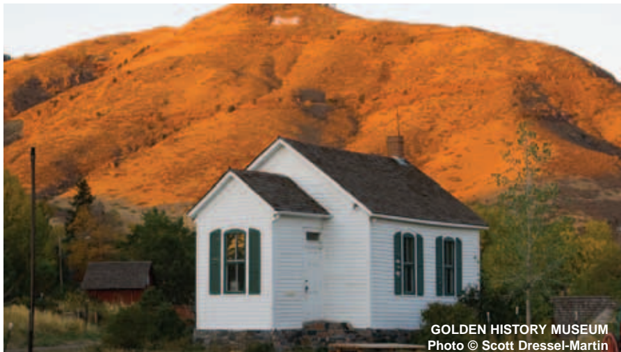
GOLDEN HISTORY MUSEUM