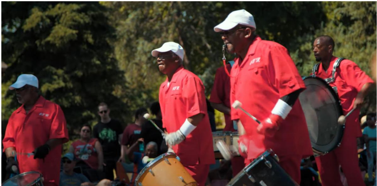
Colorado Black Arts Festival, Boogaloo Celebration Parade

It's nearly summer. Get your festival on.